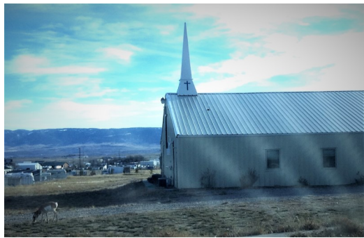
Wyoming—Can you spot the antelope?