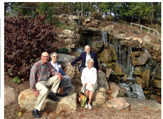
By a waterfall in Michigan