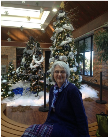
Texas Christmas tree