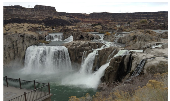
Twin Falls, Idaho