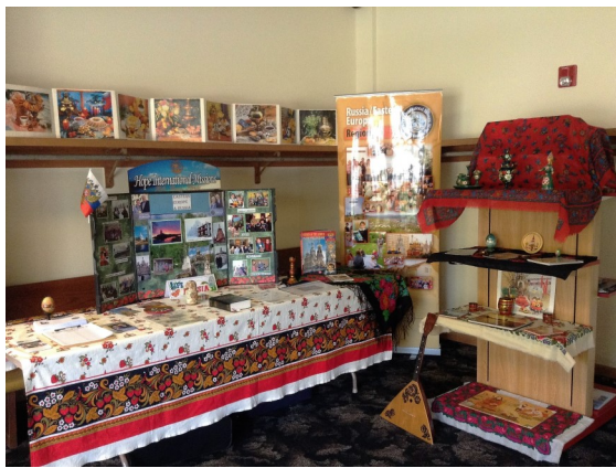
Russian Mission Display in Kansas