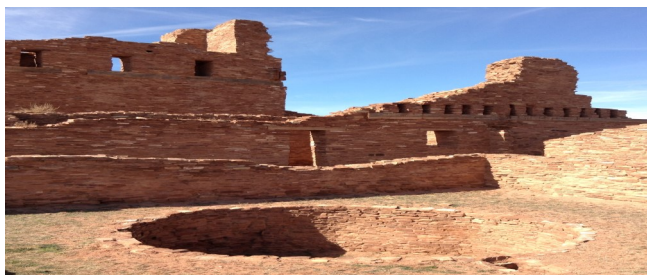
Abo Mission, New Mexico