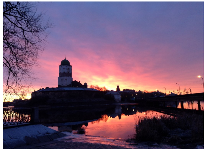
Winter sunrise on Vyborg Castle