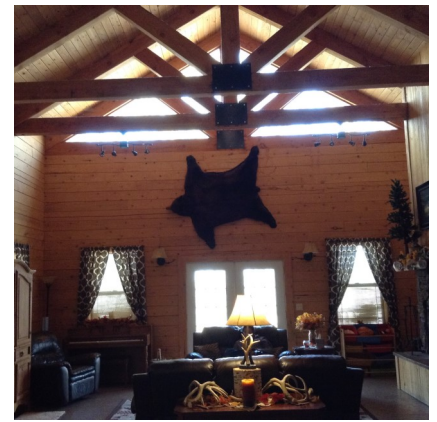
A grand house by Grand Mesa, Colorado