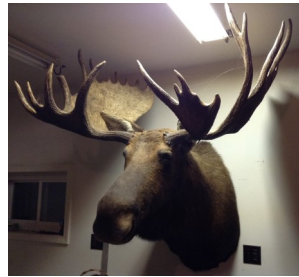
A moose in Michigan